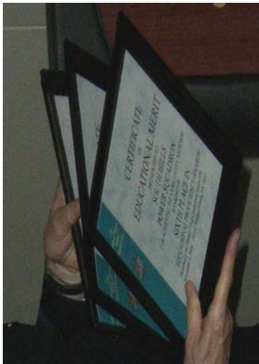
Awards at the Fall Conference (See Inside).