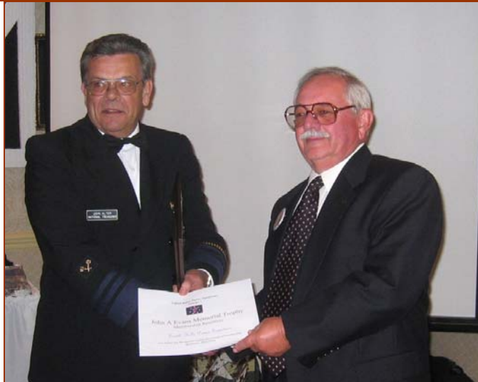
South Hills Power Squadron won second place for the John A Evans Trophy for Membership Retention.