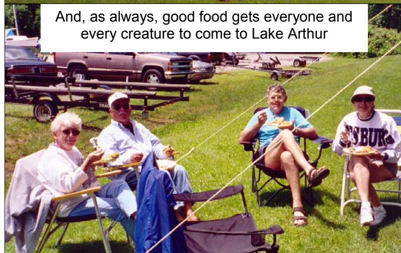
And, as always, good food gets everyone and every creature to come to Lake Arthur