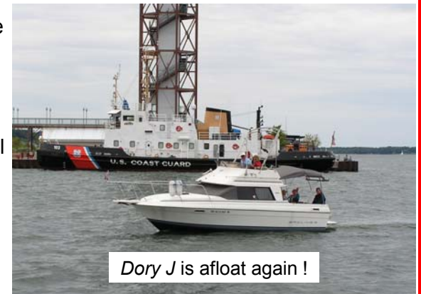
Dory J is afloat again !