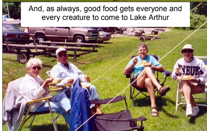
And, as always, good food gets everyone and every creature to come to Lake Arthur